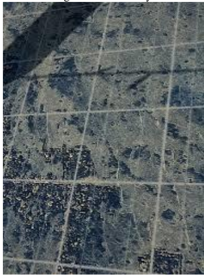
Heavy Dust on Solar Panel

The transmission of the deposited dust on the glass reduces more for lower wavelengths than for higher wavelengths. The small discontinuity in the transmittance curve at 350 and 800 nm happens during the detector change in the spectrophotometer and is a normal measurement uncertainty for the device used. For dust densities above 19 mg/cm2, the wavelength-dependence of the transmission reduction is significantly reduced. For wavelengths >570 nm, the variation between density-transmittance curves with respect to average is 2.5% whereas for wavelengths <570 nm, it is 11%. Thus, dust affects lower wavelengths more severely.